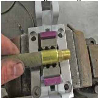
Mechanical crimped fitting